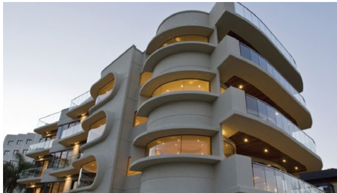
Kingdom Apartments, South Perth