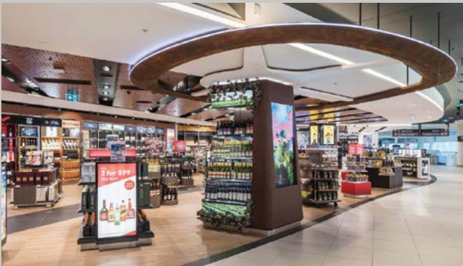
Successfully delivered Dufry's flagship duty-free upgrade at Perth Airport back in 2019, completed in stages to ensure seamless trading during construction.