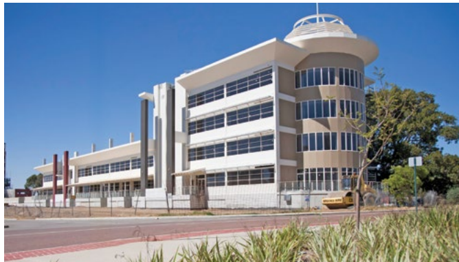
Cityscape on Swan, Rivervale