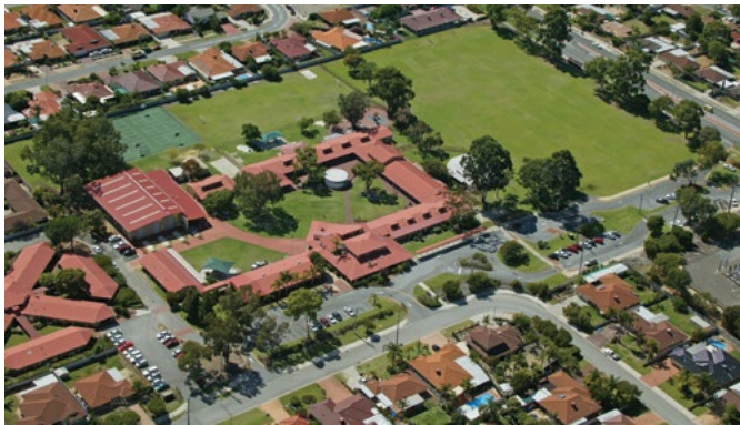
John Septimus Roe Anglican Community School

existing sports pavilion into new teaching spaces. These upgrades are being carefully integrated into the school's existing environment and align with the City of Joondalup's precinct plan. The sporting hall is set to be completed in time for the school's 40th anniversary celebrations. Proven continues to work closely with the consultant team on commercial feasibility, programme planning and design resolution for the next stages of this major campus transformation.