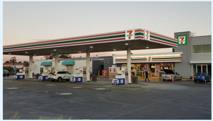
7-Eleven and Head Office For Perth, Ascot

outcomes. We've helped navigate excavation issues, long utility lead times, and traffic modifications, always keeping store openings on track.