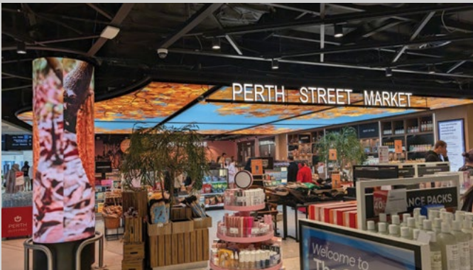
Currently managing the next phase of Avolta's retail transformation, enhancing passenger experience through bold design, sustainability, and innovation.