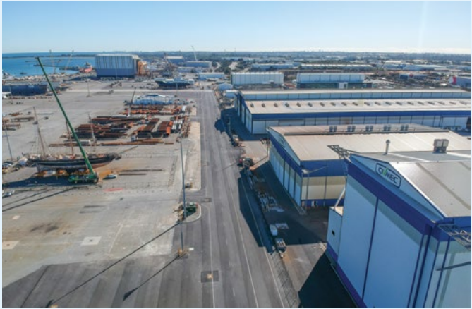
Vessel Transfer Path Upgrade

Following the Wharf Extension, Proven delivered the AMC2 project, expanding serviceable wharf deck area by infilling a section of the existing structure. The project featured complex piling, precast construction, and a heavy-duty topping slab. It was successfully completed ahead of schedule and within budget.