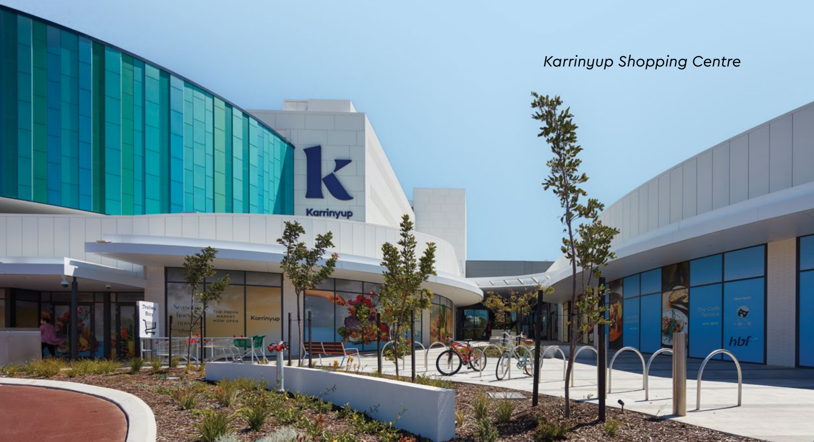
Karrinyup Shopping Centre

Although all care has been taken on the compilation of this document Greg Rowe Pty Ltd and all parties associated with its preparation disclaim any responsibility for any errors or omissions. The right is reserved to change this document at any time. This document does not constitute an invitation, agreement or contract (or any part thereof) of any kind whatsoever. Liability is expressly disclaimed by Greg Rowe Pty Ltd for any loss or damage which may be sustained by any person acting on this document.