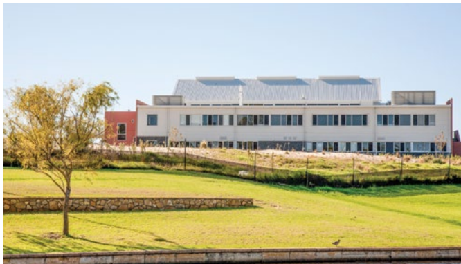
Swan Valley Anglican Community School