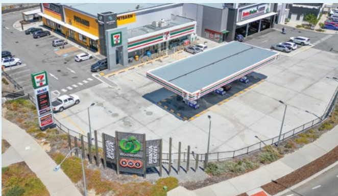
7-Eleven Banksia Grove

Over the past decade, Proven Project Management has supported 7-Eleven with the successful rollout of multiple new stores across Greater Perth. Our long-standing relationship has been built on delivering consistency, quality, and agility, ensuring each location opens on time and to specification.