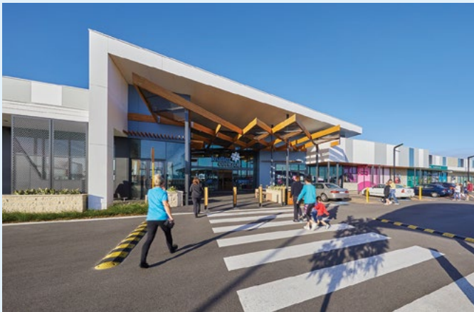
Woolworths Butler Central

These projects strengthened our understanding of retail delivery, tenant coordination, and the operational priorities of large-format retail clients. More than just delivering new shopping destinations, they laid the foundation for a trusted and enduring relationship with Fabcot.