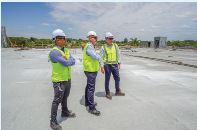
Woolworths Mt Pleasant