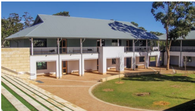
Peter Carnley Anglican Community School

One of our longest-running education sector relationships, Proven Project Management worked alongside the ASC over a 15-year period to deliver significant upgrades to John Septimus Roe Anglican Community School's Mirrabooka and Beechboro campuses. Our role as Project Manager and Superintendent included the delivery of a broad mix of facilities, from new science centres, performing arts spaces and administration hubs, to a gymnasium, enclosed learning centres, and refurbished libraries and canteens.