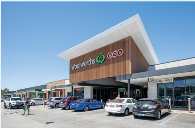
Woolworths Banksia Grove