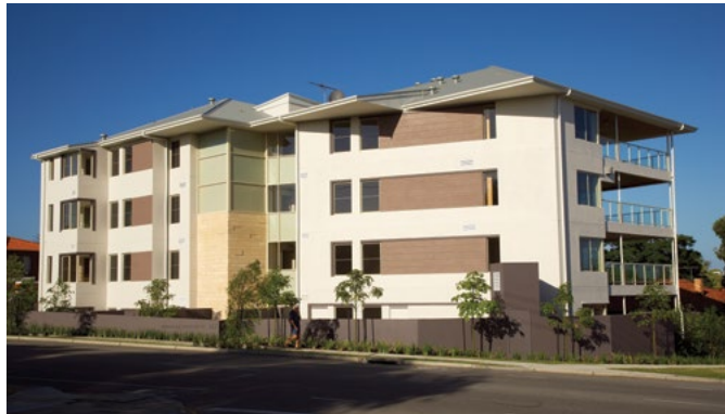
Riverwalk Apartments, Como